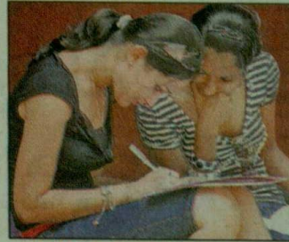
TOUGH FOR STUDENTS

New Delhi: The CBSE's decision to give just 24 hours to students to challenge the answer keys of JEE (main) and demand Rs 1000 for each question challenged has raised serious questions about the procedure.